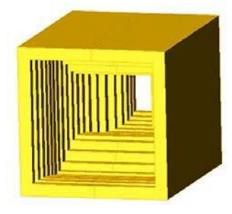
Profiled rectangular horn

In this paper the type of geometric constraints are discussed and some optimization methods are compared for handling problems that involve the variation of the geometry, and also bounds that may be required to eliminate overlap and abrupt changes in geometry. Most conventional numerical optimization methods can be used for the design. These range from evolutionary methods such as the Genetic Algorithm, and swarm methods such as the Particle Swarm Optimization. These mentioned techniques are especially valuable in a wide domain search as they balance the fittest location uncovered by an element against others uncovered by neighbours, all of which are subject to constraints. Conventional gradient methods, such as steepest descent, can be advantageous in reaching an optimum solution in fewer function evaluations though once a broad coverage technique has reached a sub-optimum solution. The paper will review some techniques that have been employed to design a range of antennas by optimization of geometry.